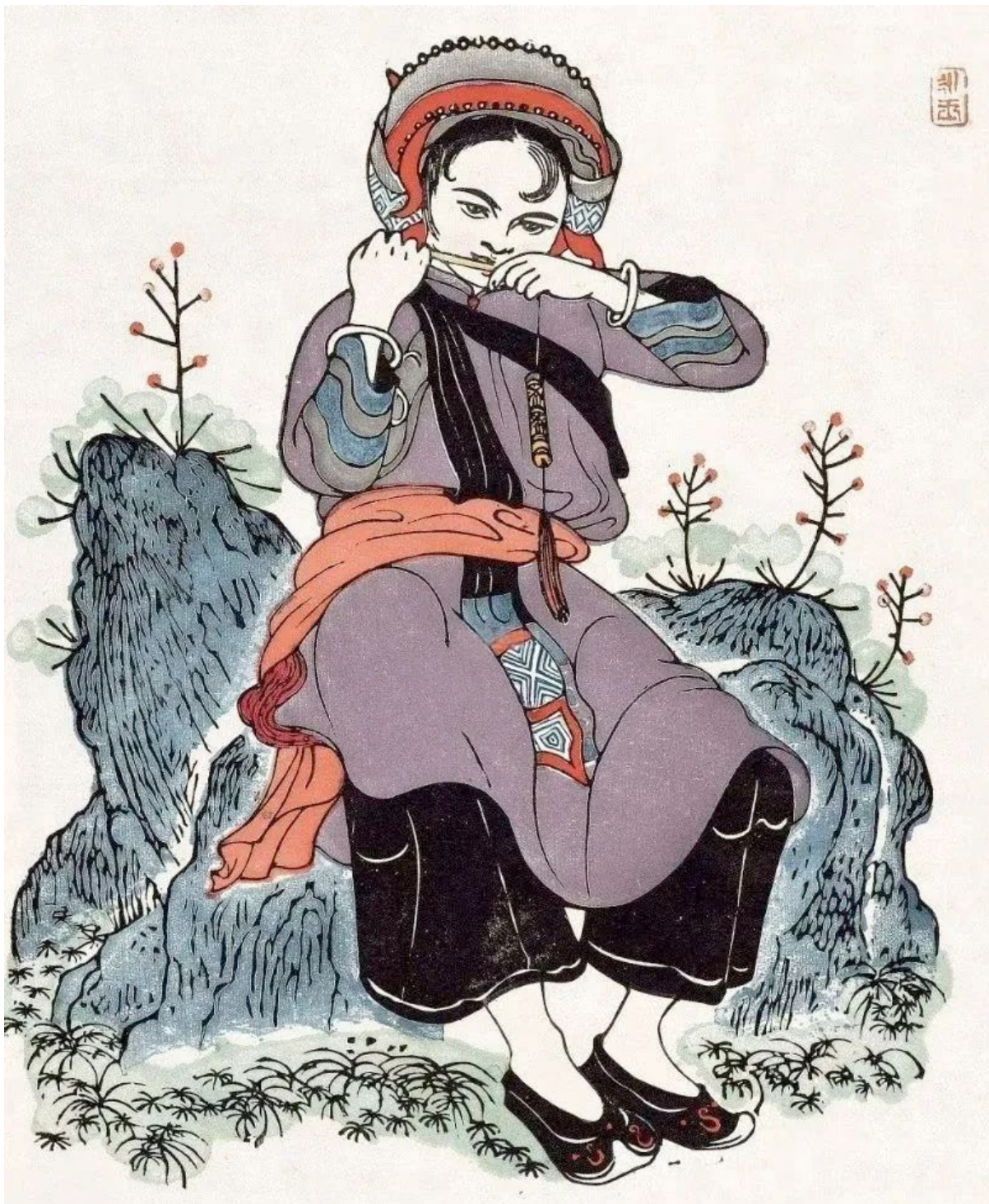
Plate(3a) Huang Yongyu(黃永玉), Ashima's illustration : playing the harmonica . 1956 . Print Making , 31x 23cm.