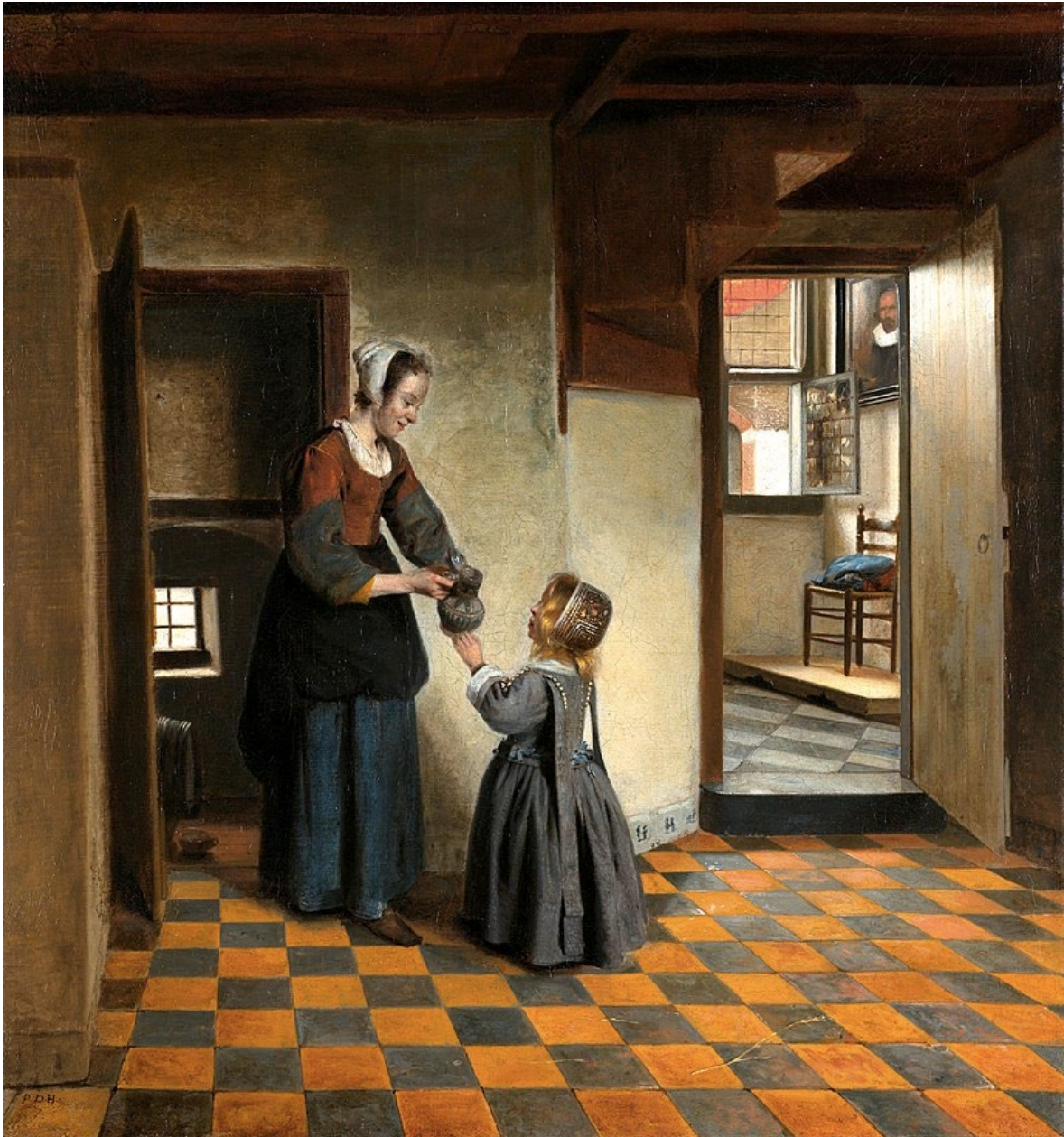
Plate(1b) Pieter de Hooch . Woman with a child in a Pantry . 1660 . Oil on Canvas ,65x 60.5cm.

(B) Create a piece of two-dimensional work based on the theme” The Happy Moment with my family member at home “.