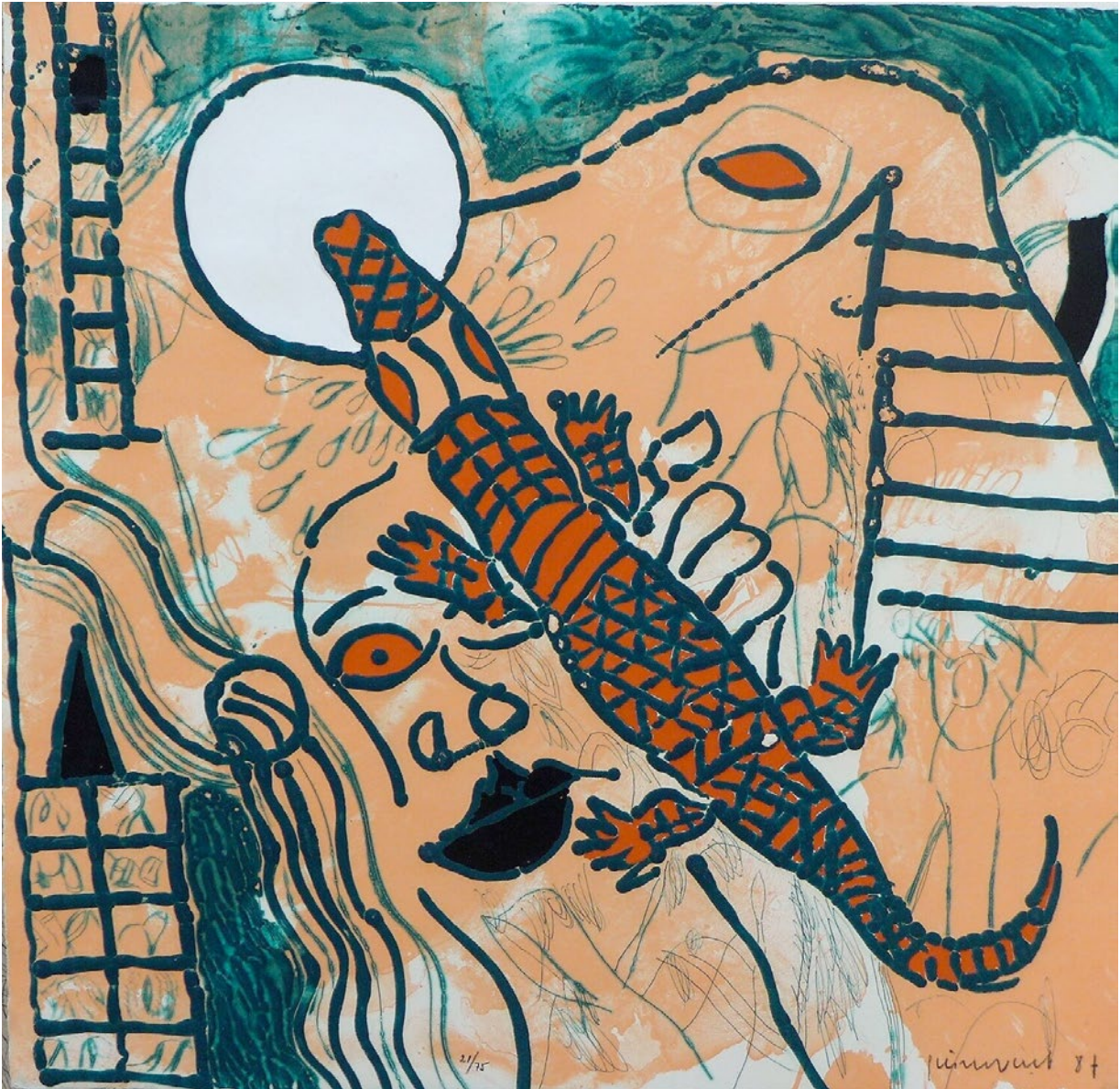
Plate (4b) Josep Guinovart. So that the crocodiles sleep in long rows. 1987 . Print Making on paper. 47 x 49 cm .

(B) Create a piece of two-dimensional work based on the theme” My travel in the safari park “. (80 marks)