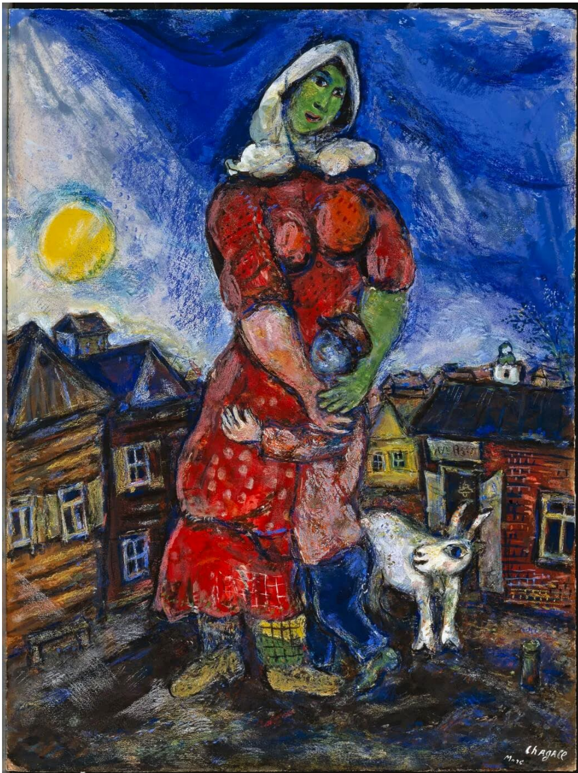
Plate(1a) March Chagall . Mother and Child . 1913 . Oil on Canvas , 61 x 81cm.