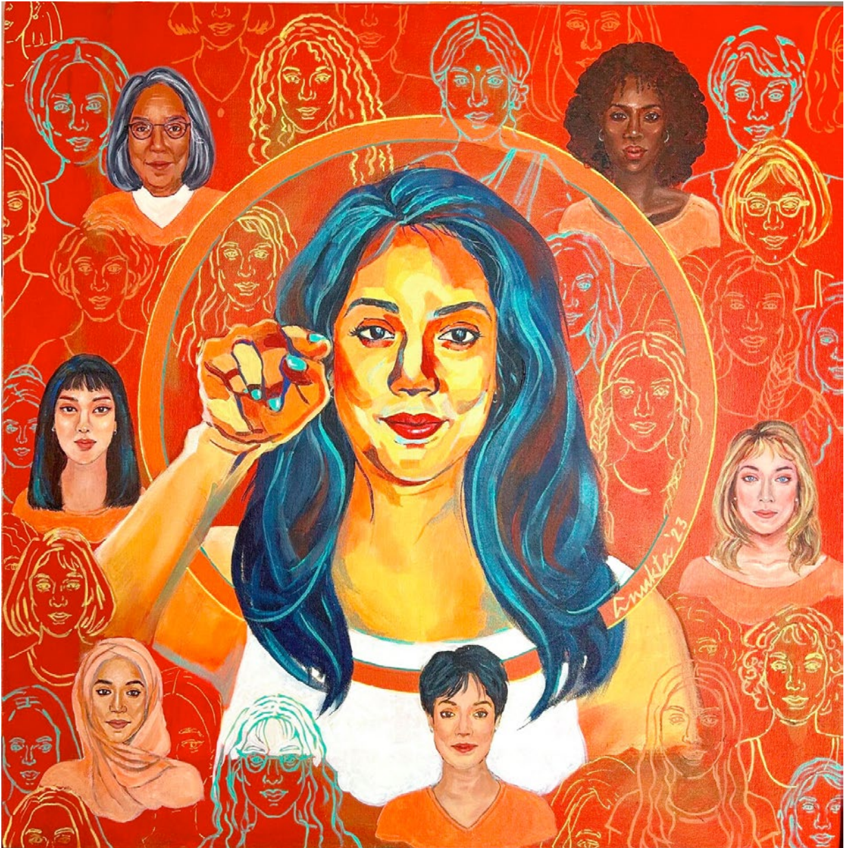
Plate(3b) Anukta Mukherjee Ghosh , REFLECTIONS - Sisterhood . 2023 . Acrylic on canvas , 76 x 76cm.

(B) Create a piece of two-dimensional work based on the theme” The princess in the fairy tale “. (80 marks)