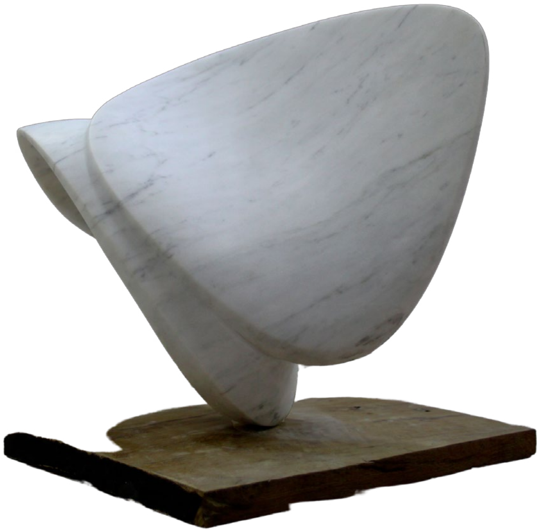
Plate (5b) Camilla cusumano, Double Playters , 2022. Mable. 33 x 33 x 27cm

(B) Create a piece of two-dimensional work based on the theme” The Spiritual World “. (80 marks)