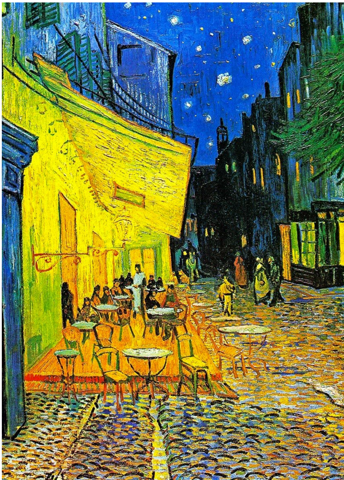
Plate(2a) Vincent Van Gogh, Cafe Terrace at Night . 1881 . Oil on canvas , 81 x 65.5cm.