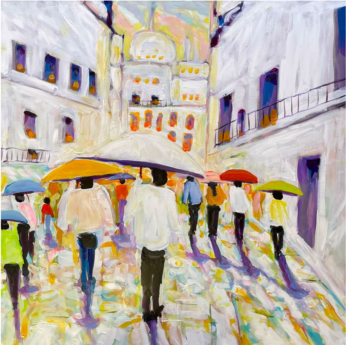
Plate(2b) Charles Wallis, Tropical Afternoon Shower Terrace . 2021 . Acrylic on canvas , 91 x 91cm.

(B) Create a piece of two-dimensional work based on the theme” The unexpected incident happened on the street “. (80 marks)