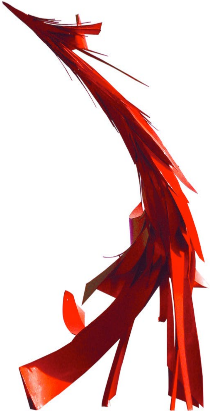
Plate (5a) Yuyu Yang(楊英風), The sign of luck , 1970, steel & iron, 700 x 900 x 600 cm.